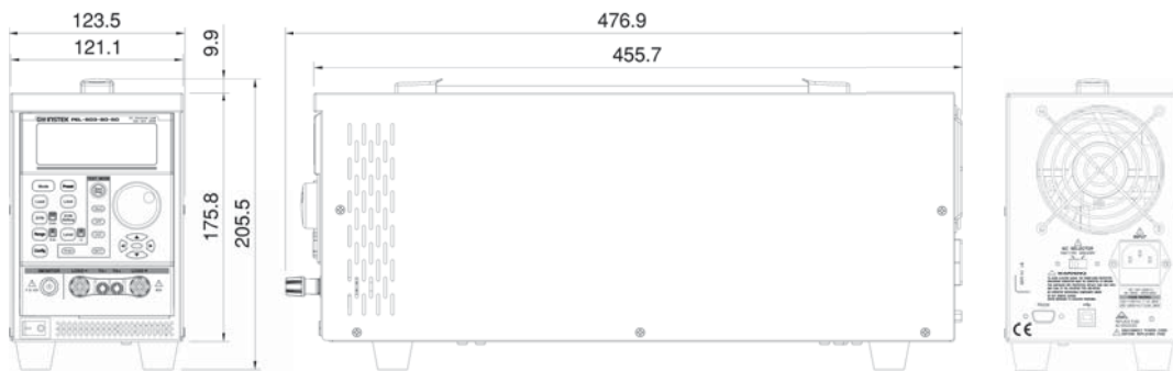
PEL-503-80-50 / PEL-504-80-70 / PEL-504-500-15