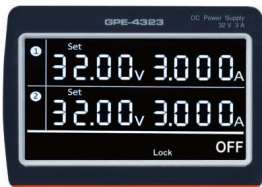
4.3 Inch LCD display provide high resolution for 10mV/1mA

The GPE-X323 series features 10mV/1mA high resolution (for setting and read back). The series outputs a pure and stable power supply. Users can easily simulate small voltage or small current measurements for DUTs that is the area the conventional low resolution linear power supplies can't achieve.