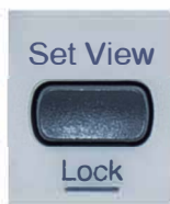
The key lock function prevent DUTs from unnecessary damages caused by mis-operation.

The GPE-X323 series has a built-in set view and key lock so as to expedite the operation process. The key lock function protects DUTs by preventing others from changing voltage/current parameters.