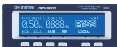
Large LCD, High Intensity Indicators and Function Keys

The 240 x 48 display clearly shows the applied voltage, test parameters, test conditions, measurement value and result on the screen at the same time. The real-time status update on the LCD display accompanied by the multi-colored LED status indicators on the front panel allow operators to have a full control of the test process to perform precession test and avoid unnecessary operation risks at the same time. The status indicator above the high voltage output terminal will automatically flash when an output is in place. In addition, the function keys arranged below the LCD display provide convenient operation that test functions can be easily changed by a single pressing.