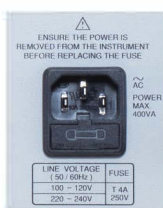
Universal Input Voltage Range

Additionally, the GPT-9600 series provides the universal input voltage range for operating equipment in countries with different electrical power standards. With the GPT-9600 series, the hustle of switching or selecting input voltage range can be left behind. Furthermore, 50Hz or 60Hz can be selected to provide a stable and appropriate test voltage without relying on the electrical environment conditions of input power so as to meet the test requirements.